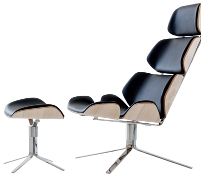
lounge chair inspired by skateboarding