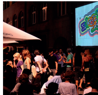
spätzle-jam 2007 - 2017