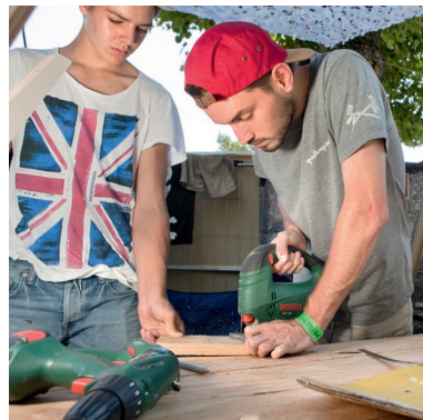
skateboard recycling - workshop