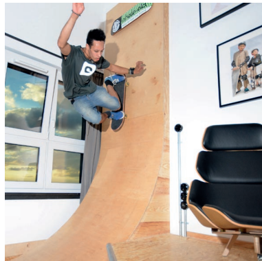
Bretterbude - hotel