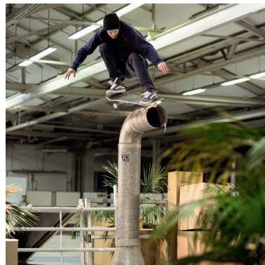
exhibition - future city